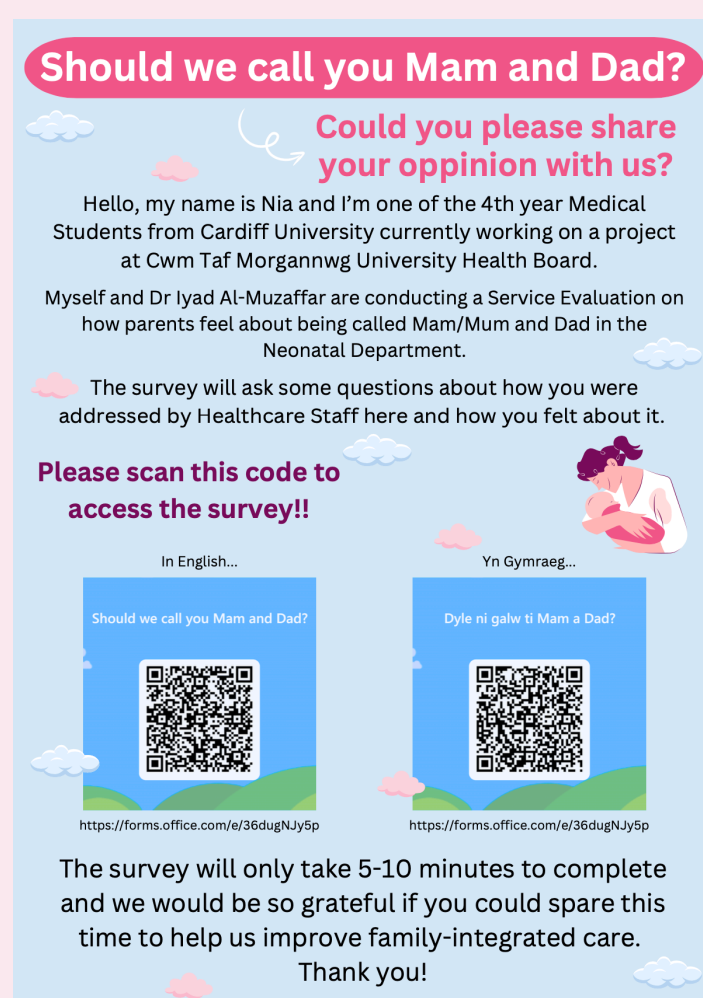
Figure 1: Poster used for distribution of the survey

We designed a survey to evaluate parents/caregivers' greeting preference and perceptions of how doctors and nurses called them. The 11-item Microsoft Forms survey consisted of multiple choice, Likert scale and demographic measures. The survey was conducted from 27th of May to 14th of June 2024.