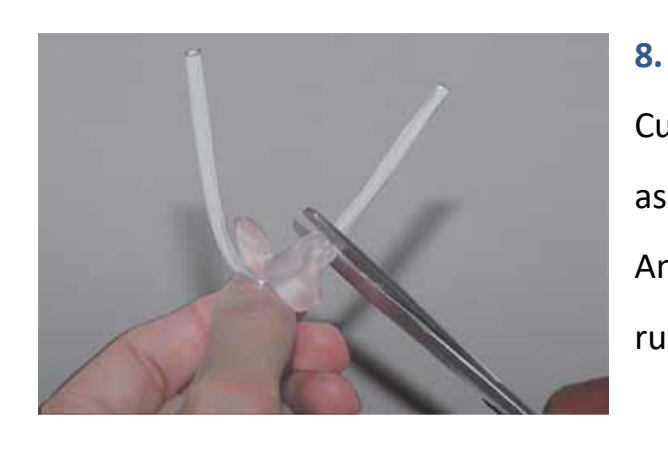
Cut the tapered tubing as close as possible to the earmould. Any tube sticking out could rub your ear and make it sore.