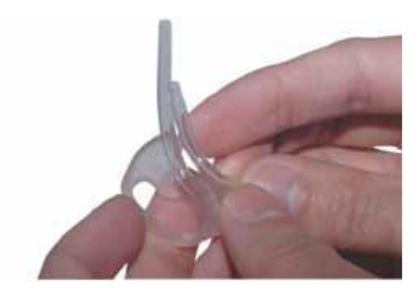
9. Take the old piece of tubing you saved and line it up with the newly threaded tube.