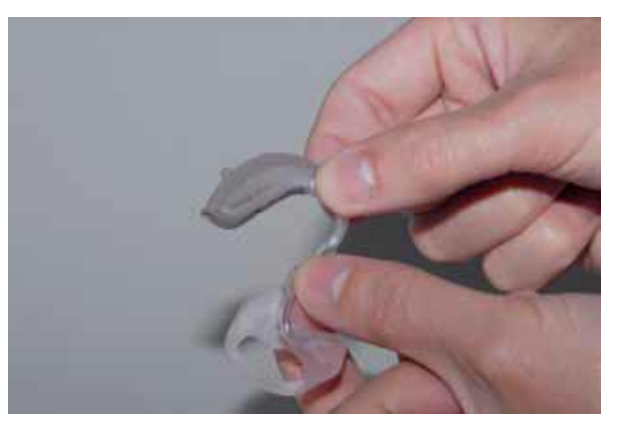
11. Push the end of the tubing onto the plastic nozzle on your hearing aid.