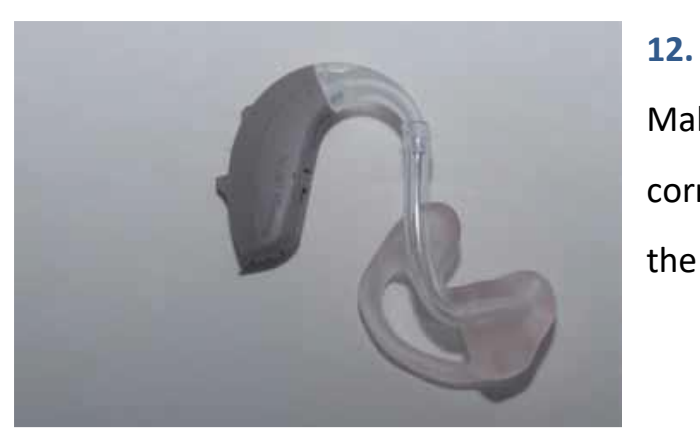
Make sure that it bends in the correct direction, as shown in the picture.