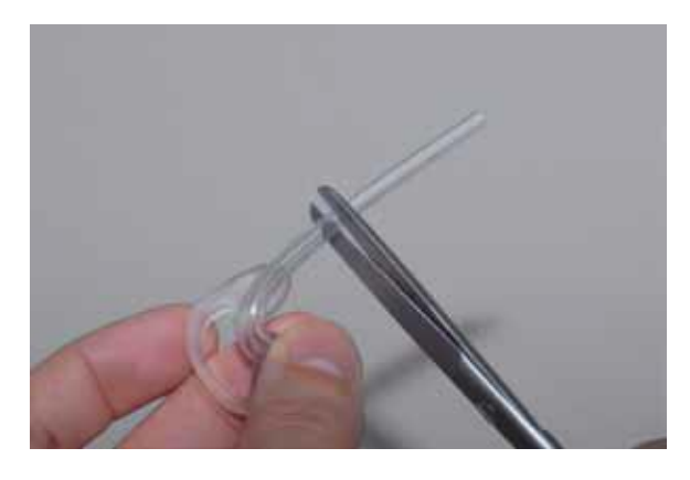
10.Cut the end to the same length.