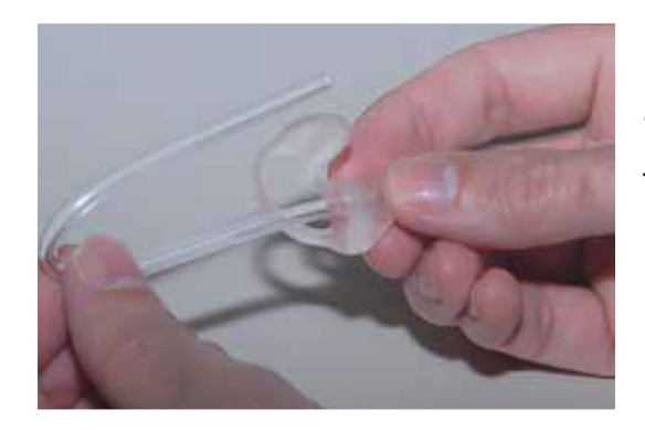
5. Thread the tubing through the earmould