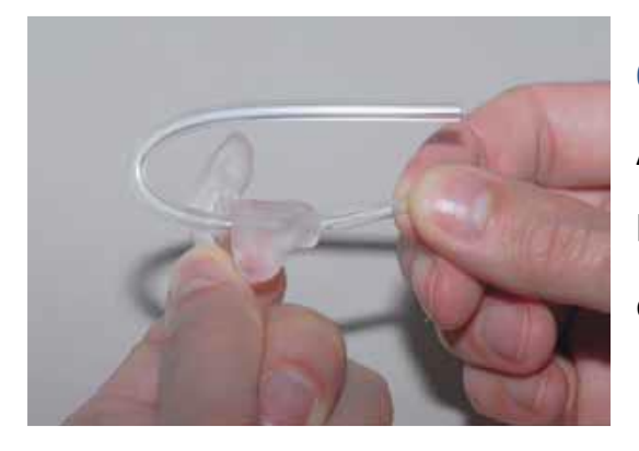
6. All the tapered section should have come through the other side.