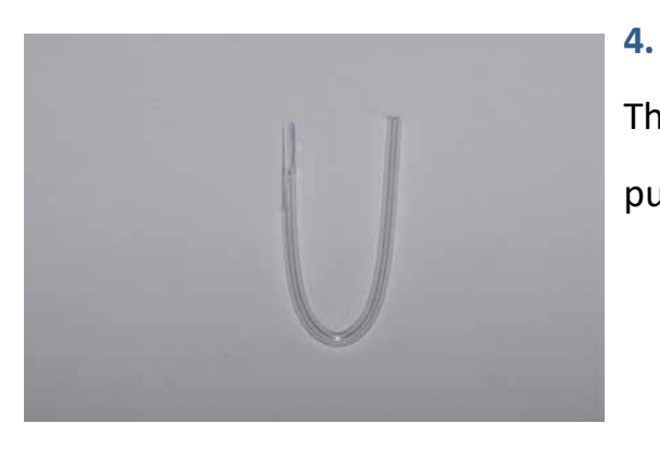
This tapered end needs to be pushed into the earmould