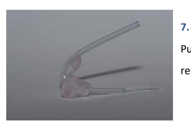
Pull the tube until the bend reaches the earmould.