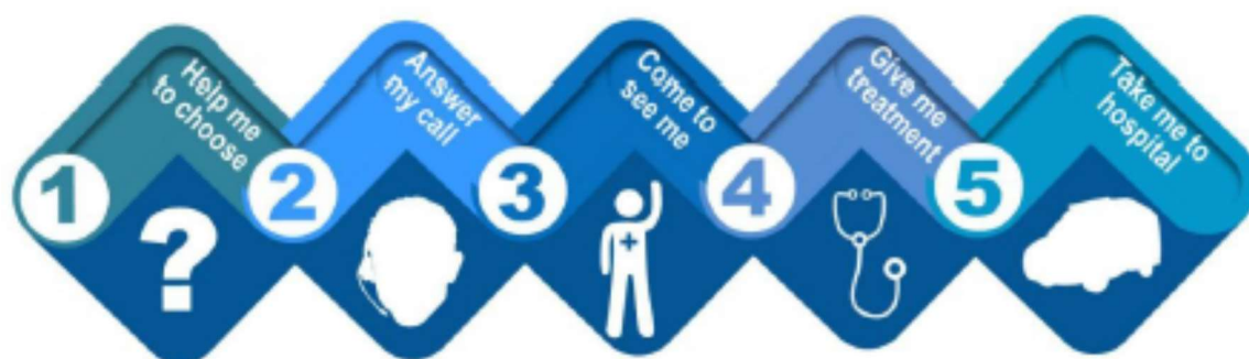
Figure 1 - CAREMORE® Emergency Ambulance Services 5 Step Model

The CAREMORE® model defines the expected care standards to be met for each of the five steps of the Ambulance Patient Care Pathway; as well as setting out activity, performance and resource management information available for each of the steps of the pathway.