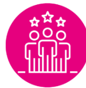
Delivering timely and high quality patient centred care

The growing case for change and that the status quo of current service provision is not sustainable from;