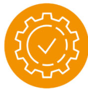
Reducing Variation and Inequity