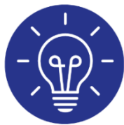
Learning and Improvement

A Regional Ophthalmology Strategy has been developed with clinical staff to set out the high level direction for the Regional Programme. The principles set out in the strategy are: