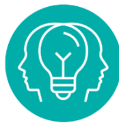
Designing Value Based best practice services