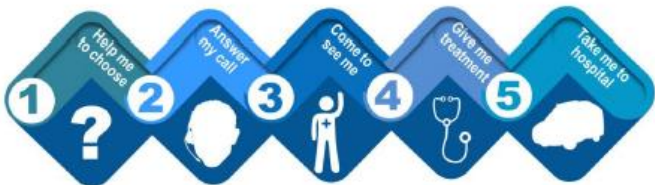
Figure 1 - CAREMORE® Emergency Ambulance Services 5 Step Model

The CAREMORE® model defines the expected care standards to be met for each of the five steps of the Ambulance Patient Care Pathway; as well as setting out activity, performance and resource management information available for each of the steps of the pathway.